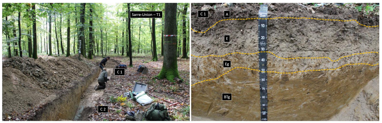
Project HFPL: Assessment of the Forest History of the Lorraine Plateau